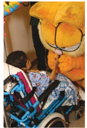
Garfield visits patients at Phoenix Children's Hospital.

The units will provide students with a private work space and dedicated areas for computers, books and related items. The carts will allow patients to have "virtual" visits with younger siblings and friends who are under the minimum age for hospital-visiting privileges.