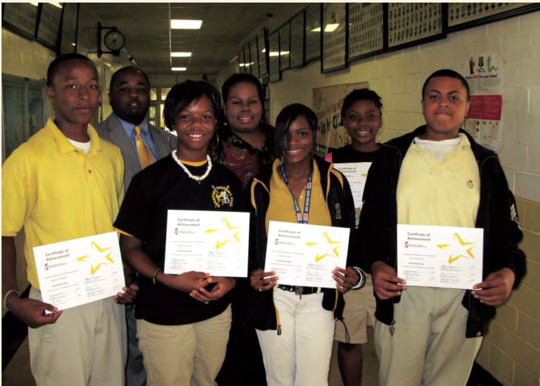
Students at Bassfield High School in Mississippi receive certificates for completing the Financial Fitness for Life program, a part of the College Knowledge Project. USA Funds supports College Knowledge, a College Access Challenge Grant initiative.