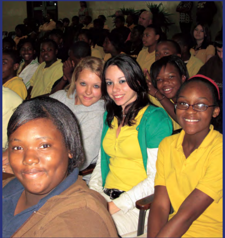
Bassfield (Miss.) High School students attend an awards ceremony through the state's College Access Challenge Grant program, College Knowledge, supported by USA Funds.

Read why the National College Access Network's executive director says the partnerships fostered by College Access Challenge Grants are vital to promoting higher education success.